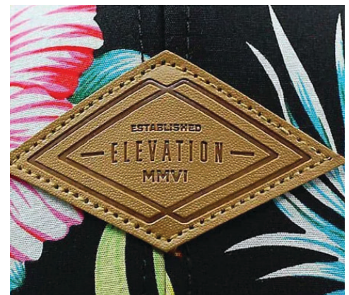
PU Leather Patch