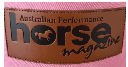
Real Leather Patch