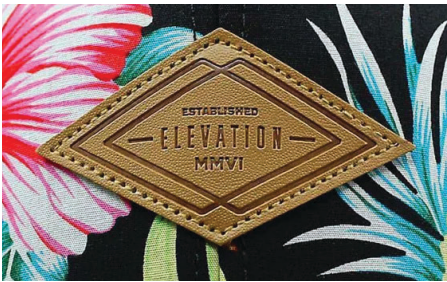
Example of PU Leather Patch

Please use a light grey patch with the logo stamped in to a dark grey colour